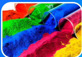
DYES & PIGMENTS